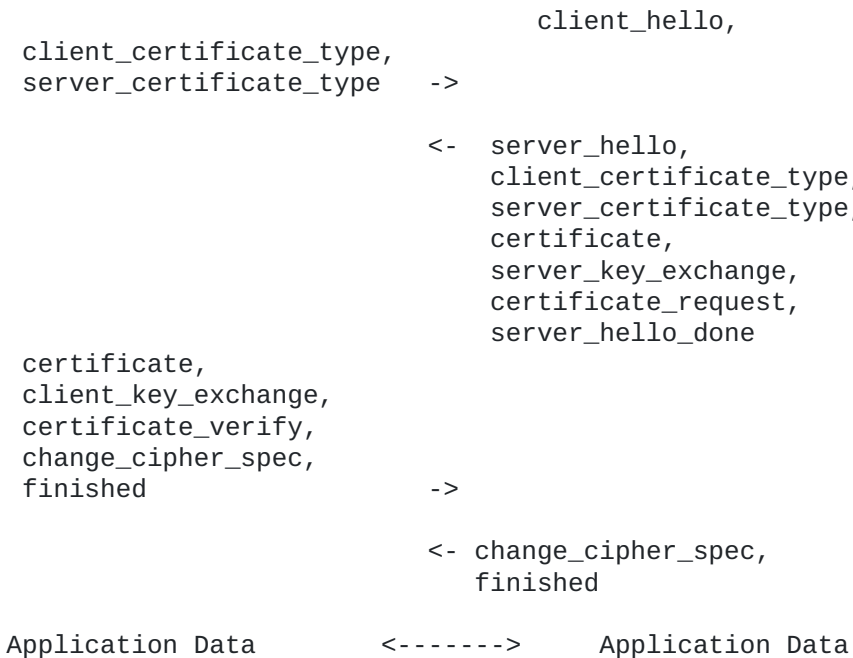
Figure 2: Basic Raw Public Key TLS Exchange

The client_certificate_type and server_certificate_type extensions sent in the client hello each carry a list of supported certificate types, sorted by client preference. When the client supports only one certificate type, it is a list containing a single element. Many types of certificates can be used, such as RawPublicKey , X.509 and OpenPGP .