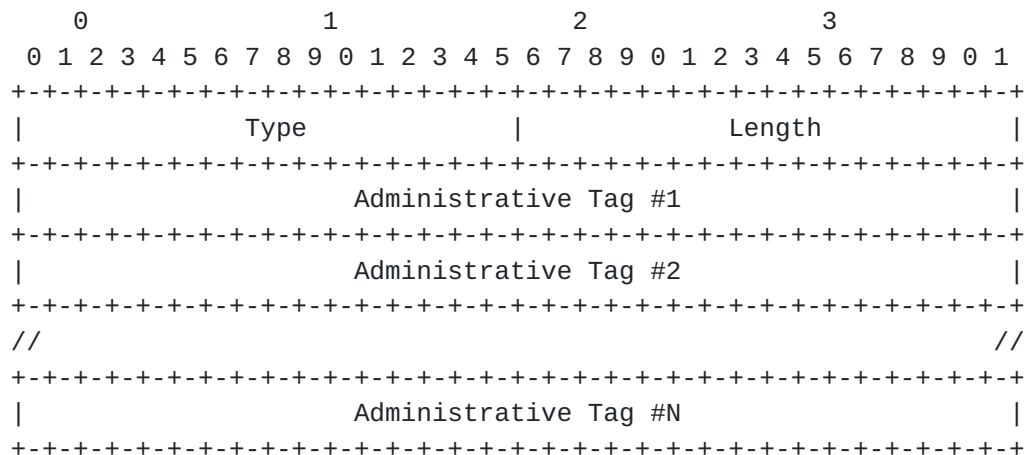
Figure 1: OSPF per-node Administrative Tag TLV