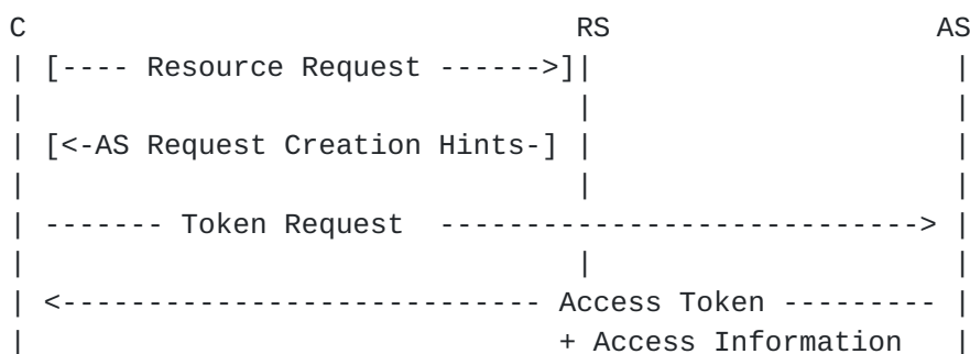
Figure 1: Retrieving an Access Token

This profile requires the client to retrieve an access token for protected resource(s) it wants to access on the resource server as specified in [I-D.ietf-ace-oauth-authz]. Figure 1 shows the typical message flow in this scenario (messages in square brackets are optional):