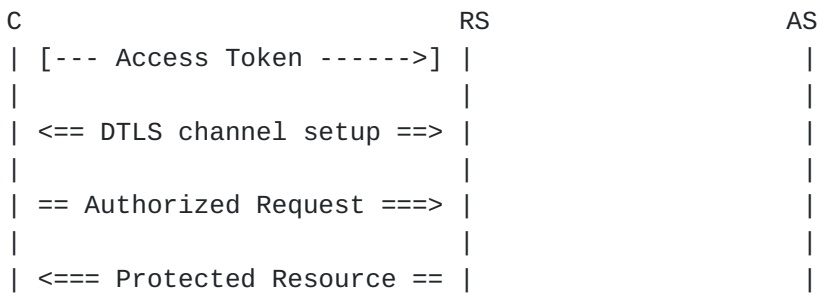
Figure 2: Protocol overview

Figure 2 depicts the common protocol flow for the DTLS profile after the client has retrieved the access token from the authorization server, AS.