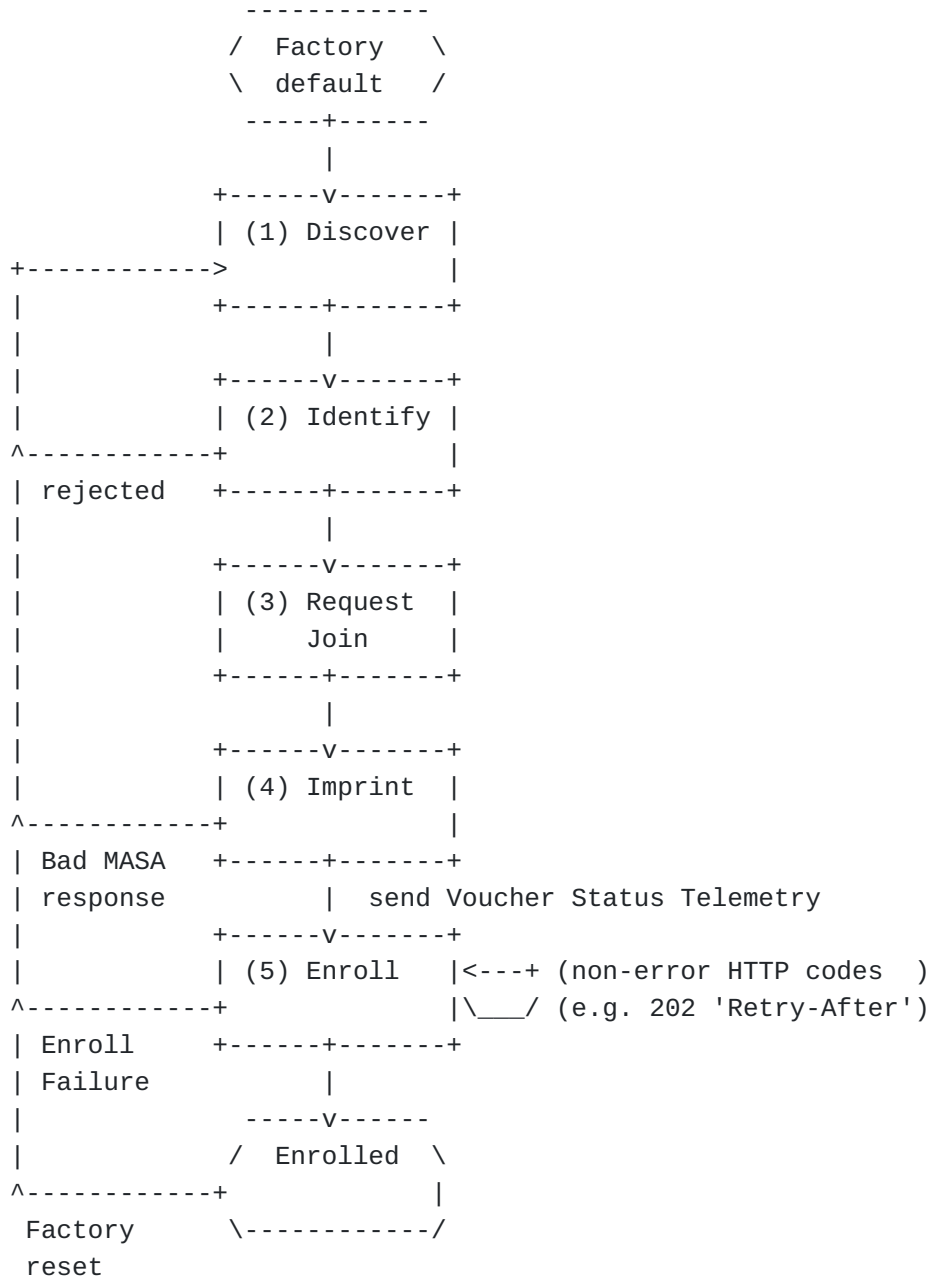
Figure 2: Pledge State Diagram

The pledge goes through a series of steps, which are outlined here at a high level.