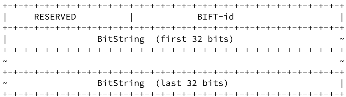
Figure 3: BIER BFD Sub-TLV for OSPF extension