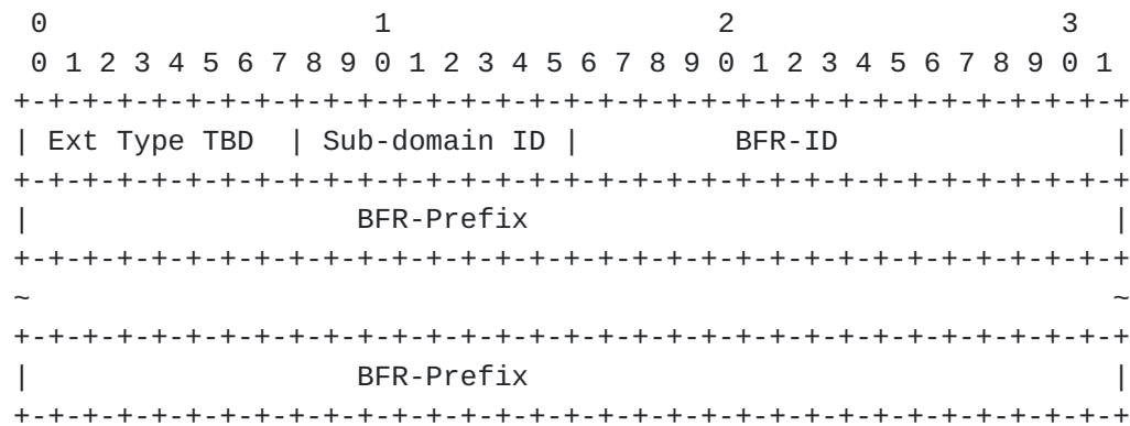
Figure 1: MLD/IGMP Extension Type for BIER