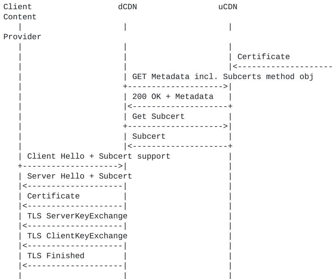
Figure 2: Example call-flow of SubCert delegation in CDNI

As expressed in [ I-D.ietf-tls-subcerts ], when an origin has set a delegation to a downstream entity such as a downstream CDN (i.e. dCDN), the dCDN should present the Origin or uCDN certificate or "delegated_credential" during the TLS handshake [ RFC8446 ] to the end-user client application, instead of its own certificate.