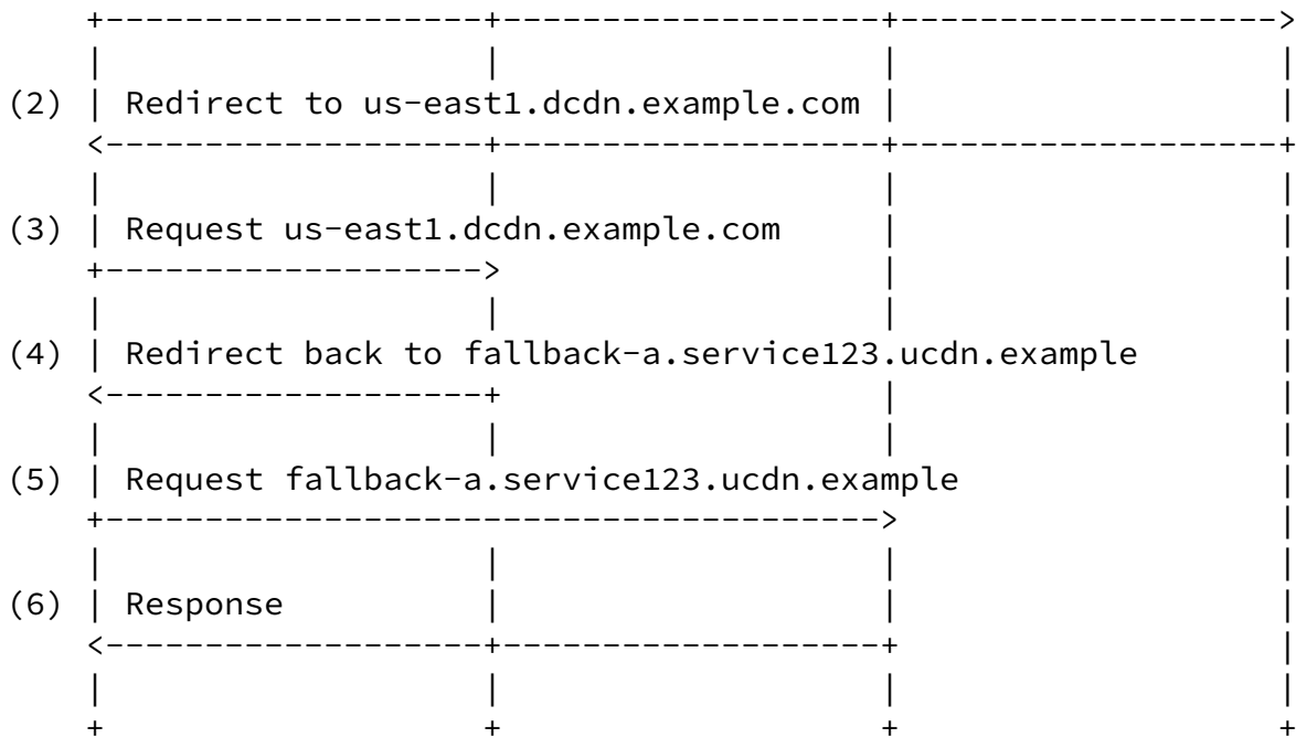
Figure 4: Redirection to Fallback Target