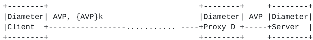
Figure 4: End-to-Middle Diameter AVP Security Protection.

In the third scenario shown in Figure 4 a Diameter proxy acts on behalf of the Diameter server.