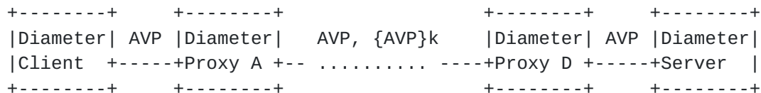
Figure 5: Middle-to-Middle Diameter AVP Security Protection.

The fourth and the final scenario (see Figure 5) is a combination of the end-to-middle and the middle-to-end scenario shown in Figure 4 and in Figure 3. From a deployment point of view this scenario is easier to accomplish for two reasons: First, Diameter clients and Diameter servers remain unmodified. This ensures that no modifications are needed to the installed Diameter infrastructure, except for the security enabled proxies obviously. Second, the key management is also simplified since fewer number of keys need to be negotiated and provisioned. The assumption here is that the number of security enabled proxies would be significantly less than unprotected Diameter nodes in the installed base.