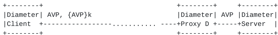
Figure 4: End-to-Middle Diameter AVP Security Protection.

In the third scenario shown in Figure 4 a Diameter proxy acts on behalf of the Diameter server.