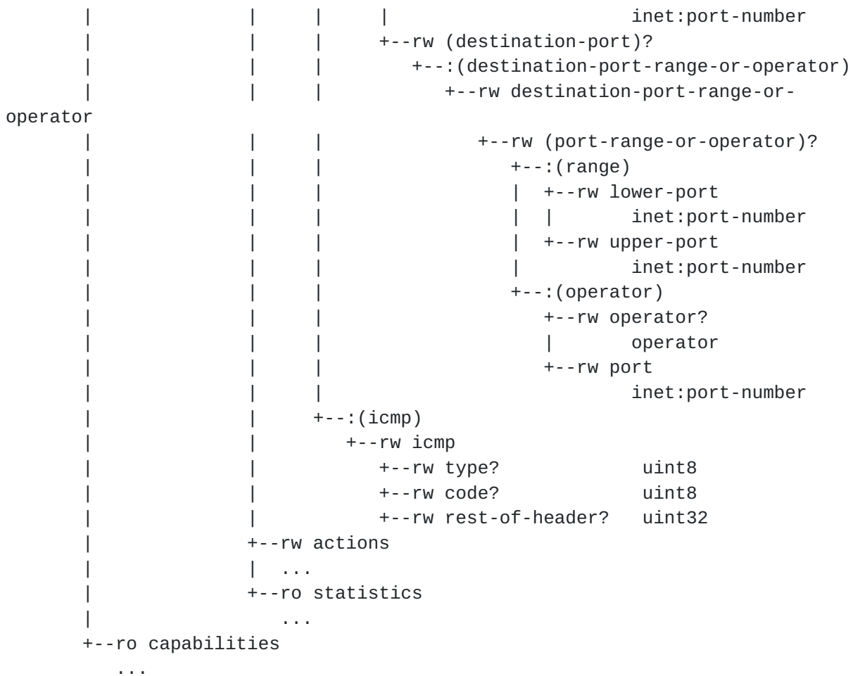
Figure 9: DOTS ACLs Subtree (UDP and ICMP Match)

DOTS implementations MUST support the following matching criteria: