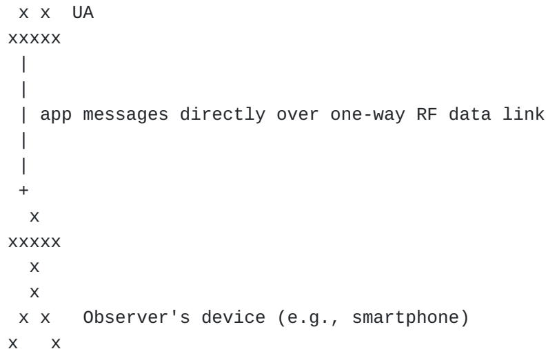
Figure 4: "Broadcast RID Information Flow"

Figure 4 illustrates Broadcast RID information flow. Note the absence of the Internet from the figure. This is because Broadcast RID is one-way direct transmission of application layer messages over a RF data link (without IP) from the UA to local Observer devices. Internet connectivity is involved only in what the Observer chooses to do with the information received, such as verify signatures using a web-based Broadcast Authentication Verifier Service and look up information in registries using the UAS ID as the primary unique key.