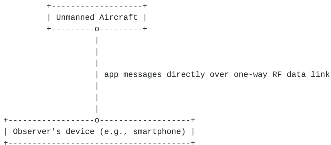
Figure 4: "Broadcast RID Information Flow"

Figure 4 illustrates Broadcast RID information flow. Note the absence of the Internet from the figure. This is because Broadcast RID is one-way direct transmission of application layer messages over a RF data link (without IP) from the UA to local Observer devices. Internet connectivity is involved only in what the Observer chooses to do with the information received, such as verify signatures using a web-based Broadcast Authentication Verifier Service and look up information in registries using the UAS ID as the primary unique key.