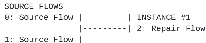
Figure 3: Scenario #2

In this example, we have two source video flows (mid:S1 and mid:S2) and one FEC repair flow (mid:R1), protecting both source flows. We form one FEC group with the "a=group:FEC-XR S1 S2 R1" line. The source and repair flows are sent to the same port on different multicast groups. The repair window is set to 150500 us.