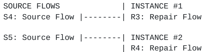
Figure 3: Scenario #3

In this example, we have two source video flows (mid:S4 and mid:S5) and two FEC repair flows (mid:R3 and mid:R4). The source flows mid:S4 and mid:S5 are protected by the repair flows mid:R3 and mid:R4, respectively. We form two FEC groups with the "a=group:FEC-FR S4 R3" and "a=group:FEC-FR S5 R4" lines. The source and repair flows are sent to the same port on different multicast groups. The repair window is set to 200 ms and 400 ms for the first and second FEC group, respectively.