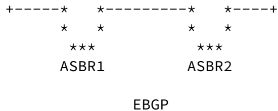
Figure3: Experimental deployment of 2nd best RR

The following is a list of configuration changes required to enable the 2nd best path route reflector RR' as a single platform or to enable one of the existing control plane RRs for diverse-path functionality: