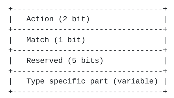
Fig 2. ORF entry encoding

Reserved is a 5-bit field. It is set to 0 on transmit and ignored on receive.