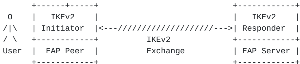
Figure 1 (EAP and IKEv2 endpoints are co-located) shows a configuration where the EAP and the IKEv2 endpoints are co-located. Authenticating the IKEv2 responder using both EAP and public key signatures is redundant. Offering EAP based authentication has the advantage that multiple different authentication and key exchange protocols are available with EAP with different security properties (such as strong password based protocols, protocols offering user identity confidentiality and many more).

In this section we describe two scenarios for extensible authentication within IKEv2. These scenarios are intended to be illustrative examples rather than specifying how things should be done.