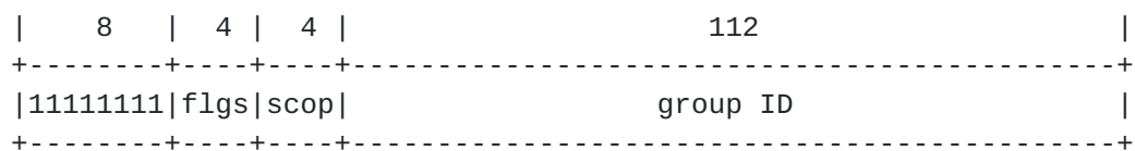
Figure 1: Generic IPv6 multicast address format

Section 2.7 of [ ADDRARCH ] defines the following operational format of IPv6 multicast addresses: