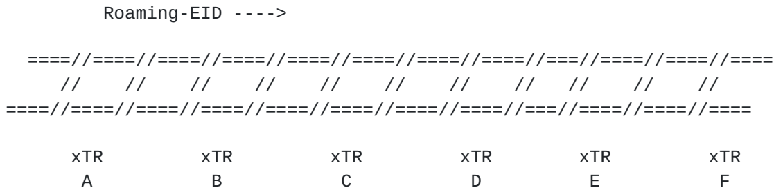
Figure 1: Directional Mobility

For the send direction from roaming-EID to any destination can be accomplish as a local decision. As long as the roaming-EID is in signal range to any xTR along the path, it can use it to forward packets. The LISP xTR, acting as an ITR, can forward packets to destinations in non-LISP sites as well as to stationary and roaming EIDs in LISP sites. This is accomplished by using the LISP overlay via dynamic packet encapsulation. When the roaming-EID sends packets, the LISP xTR must discover the EID and MAY register the EID with a set of RLOCs to the mapping system [ I-D.ietf-lisp-eid-mobility ]. The discovery process is important because the LISP xTR, acting as an ETR for decapsulating packets that arrive, needs to know what local ports or radios to send packets to the roaming-EID.