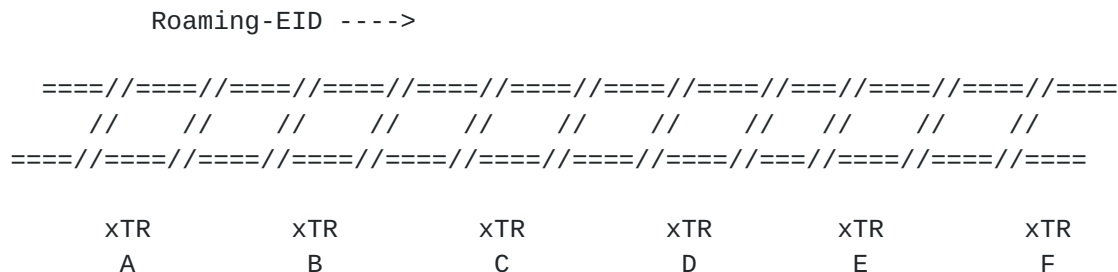
Figure 1: Directional Mobility

First we should examine both the send and receive directions with respect to the roaming-EID. Refer to Figure 1 for discussion. We show a network node with a fixed EID address assigned to a roaming-EID moving along a train track. And there are LISP xTRs deployed as Road-Side-Units to support the connectivity between the roaming-EID and the infrastructure or to another roaming-EID.