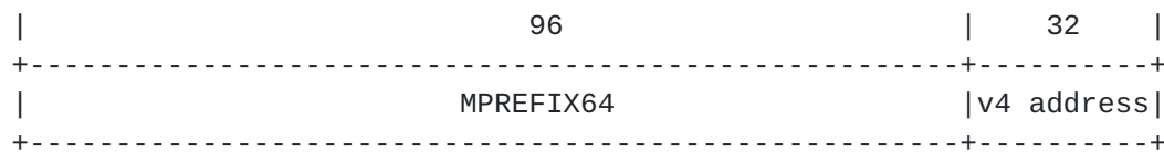
Figure 2: IPv4-Embedded IPv6 Multicast Address Format