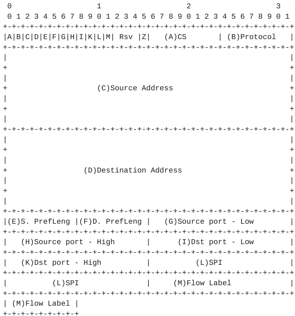
Figure 5: IPv6 Filter Rule Descriptor

Each flag indicates whether the corresponding field is present in the message