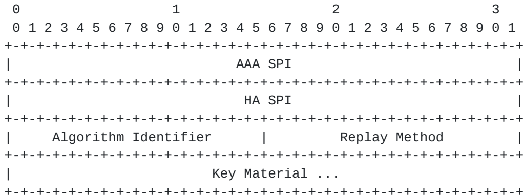
Figure 2: The Unsolicited MN-HA Key Material From AAA Subtype-Specific Data

The Unsolicited MN-HA Key Material From AAA is subtype 1 of the Generalized MN-HA Key Reply Extension [ 11 ].