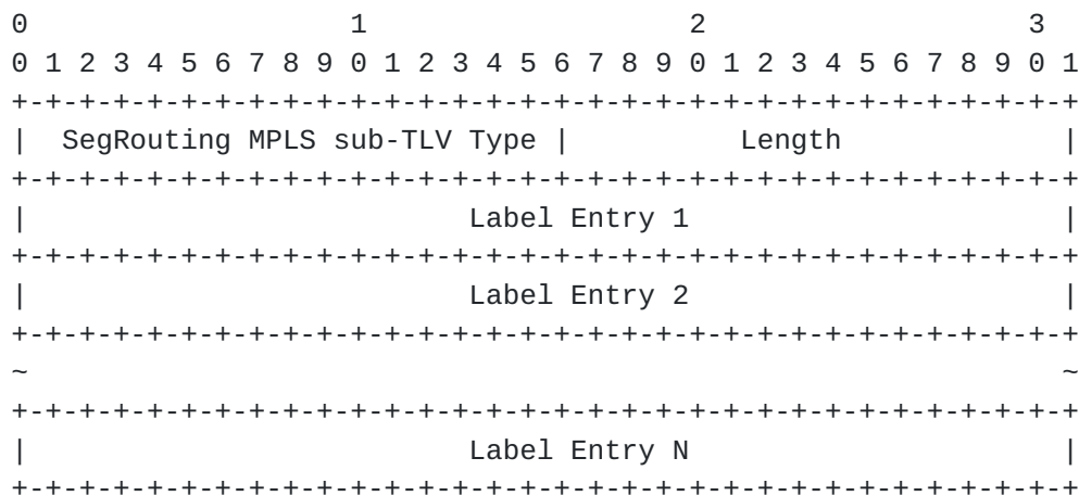
Figure 2: Segment Routing MPLS Tunnel sub-TLV

In addition to Static and RSVP-TE, Segment Routing with MPLS data plane can be used to set an explicit path. In this case a new sub-TLV is defined in this document as presented in Figure 2.