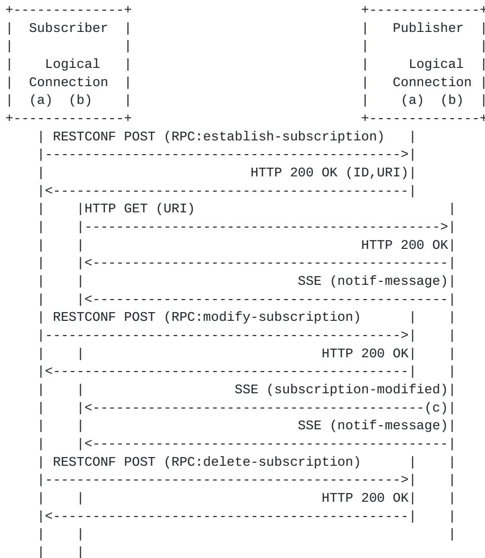
Figure 1: Dynamic with server-sent events

Additional requirements for dynamic subscriptions over SSE include: