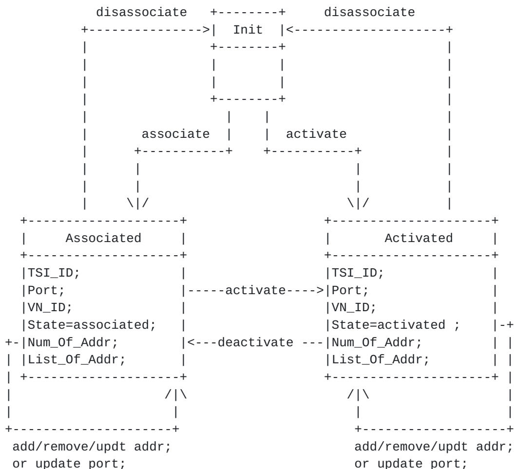
Figure 6 State Transition Example of a TSI Instance on an External NVE

The Associated state of a TSI instance on an external NVE indicates all the addresses for that TSI have already associated with the VAP of the external NVE on a given port e.g. on port p for a given VN but no real traffic to and from the TSI is expected and allowed to pass through. An NVE has reserved all the necessary resources for that TSI. An external NVE may report the mappings of its underlay IP address and the associated TSI addresses to NVA and relevant network nodes may save such information to their mapping tables but not their forwarding tables. An NVE may create ACL or filter rules based on the associated TSI addresses on that attached port p but not enable them yet. The local tag for the VN corresponding to the TSI instance should be provisioned on port p to receive packets.