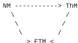
Figure 1: PCN Codepoint Re-Marking Diagram for Dual Marking (DM)

The intuitive approach for PCN-based AC and FT requires that threshold and excess-traffic-marking are simultaneously activated on all links of a PCN domain and their reference rate is configured with the PCN-admissible-rate (AR) and the PCN-supportable-rate (SR), respectively. Threshold-marking meters all PCN traffic, but re-marks only not-marked traffic (NM) to ThM. Excess-traffic-marking meters only non-ETM traffic and re-marks either not-marked (NM) or threshold-marked (ThM) PCN traffic to ETM. Thus, both meters and markers need to identify PCN packets and their exact PCN codepoint. We call this marking behavior dual marking (DM) and Figure 1 illustrates all possible re-marking actions.