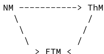
Figure 1: PCN Codepoint Re-Marking Diagram for Dual Marking (DM)

The intuitive approach for PCN-based AC and FT requires that threshold and excess-traffic-marking are simultaneously activated on all links of a PCN domain and their reference rate is configured with the PCN-admissible-rate (AR) and the PCN-supportable-rate (SR), respectively. Threshold-marking meters all PCN traffic, but re-marks only not-marked traffic (NM) to ThM. Excess-traffic-marking meters only non-ETM traffic and re-marks either not-marked (NM) or threshold-marked (ThM) PCN traffic to ETM. Thus, both meters and markers need to identify PCN packets and their exact PCN codepoint. We call this marking behavior dual marking (DM) and Figure 1 illustrates all possible re-marking actions.