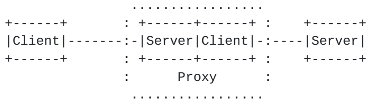
Figure 1: Reference Architecture

This document defines a new PCP [ RFC6887 ] functional element: the PCP Proxy. As shown in Figure 1, the PCP proxy is logically equivalent to a PCP client back-to-back with a PCP server. The "glue" between the two is what is specified in this document. Other than that "glue", the server and the client behave exactly like their regular counterparts.