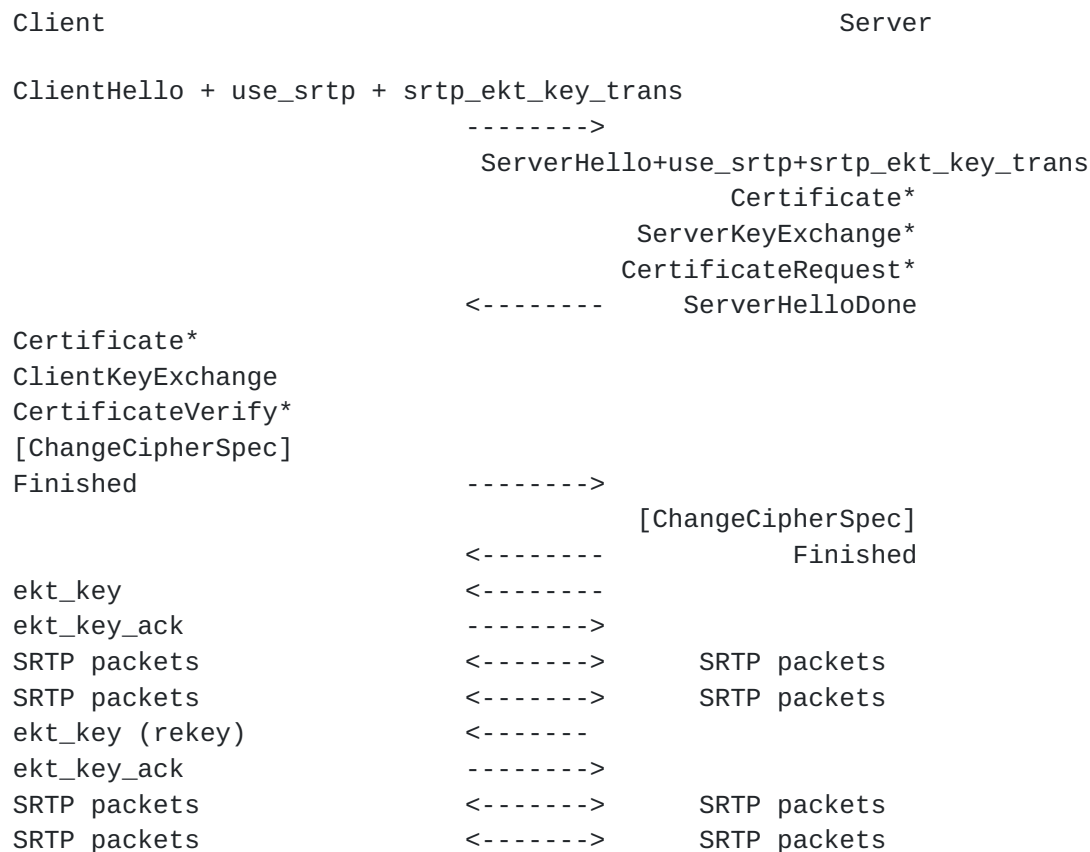
Figure 5: DTLS/SRTP Message Flow

Note that when used in PERC [ I-D.ietf-perc-private-media-framework ], the Server is actually split between the Media Distributor and Key Distributor. The messages in the above figure that are "SRTP packets" will not go to the Key Distributor but the other packets will be relayed by the Media Distributor to the Key Distributor.