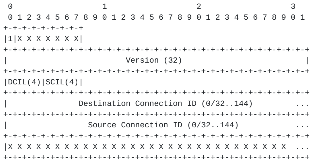
Figure 1: QUIC Long Header

A QUIC packet with a long header has the high bit of the first byte set to 1. All other bits in that byte are version specific.