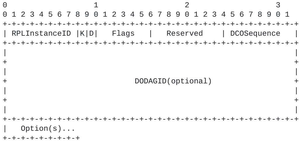
Figure 3: DCO base object

A new ICMPv6 RPL control message type is defined by this specification called as "Destination Cleanup Object" (DCO), which is used for proactive cleanup of state and routing information held on behalf of the target node by 6LRs. The DCO message always traverses downstream and cleans up route information and other state information associated with the given target.