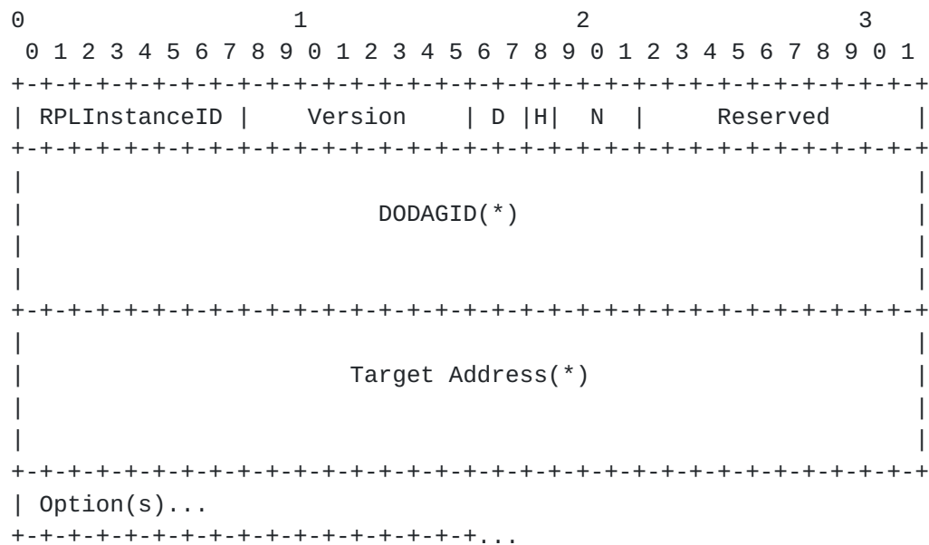
Figure 2: Format of the Discovery Reply Object (DRO)

This document defines a new RPL Control Message type, the Discovery Reply Object (DRO) with code 0x04 (to be confirmed by IANA), that serves the following functions: