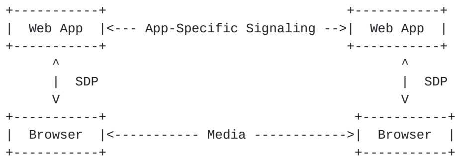
Figure 1: JSEP Signaling Model

JSEP does not specify a particular signaling model or state machine, other than the generic need to exchange session descriptions in the fashion described by [RFC3264] (offer/answer) in order for both sides of the session to know how to conduct the session. JSEP provides mechanisms to create offers and answers, as well as to apply them to a session. However, the browser is totally decoupled from the actual mechanism by which these offers and answers are communicated to the remote side, including addressing, retransmission, forking, and glare handling. These issues are left entirely up to the application; the application has complete control over which offers and answers get handed to the browser, and when.