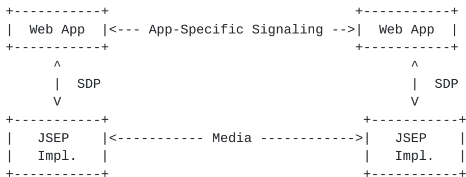
Figure 1: JSEP Signaling Model

JSEP does not specify a particular signaling model or state machine, other than the generic need to exchange session descriptions in the fashion described by [RFC3264] (offer/answer) in order for both sides of the session to know how to conduct the session. JSEP provides mechanisms to create offers and answers, as well as to apply them to a session. However, the JSEP implementation is totally decoupled from the actual mechanism by which these offers and answers are communicated to the remote side, including addressing, retransmission, forking, and glare handling. These issues are left entirely up to the application; the application has complete control over which offers and answers get handed to the implementation, and when.