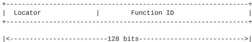
Figure 2. PSID in Format LOC:FUNCT

The Function Type of an SRv6 Path Segment is END.PSID (End Function with Path Segment Identifier).