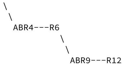
Figure 1: An Example of Loosely Routed Inter-domain P2MP-TE LSP Tree