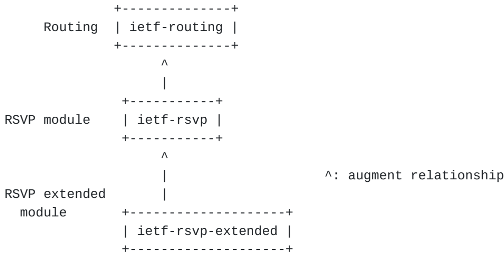
Figure 1: Relationship of RSVP and RSVP extended modules with other protocol modules

The relationship between the base and RSVP extended YANG modules and the IETF routing YANG model is shown in Figure 1 .