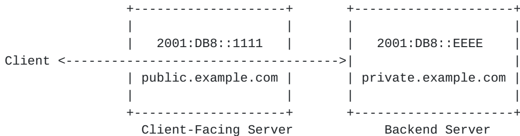
Figure 2: Split Mode Topology

In Shared Mode, the provider is the origin server for all the domains whose DNS records point to it and clients form a TLS connection directly to that provider, which has access to the plaintext of the connection.