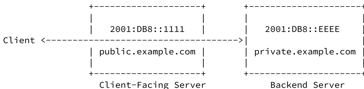
Figure 2: Split Mode Topology

In Shared Mode, the provider is the origin server for all the domains whose DNS records point to it and clients form a TLS connection directly to that provider, which has access to the plaintext of the connection.