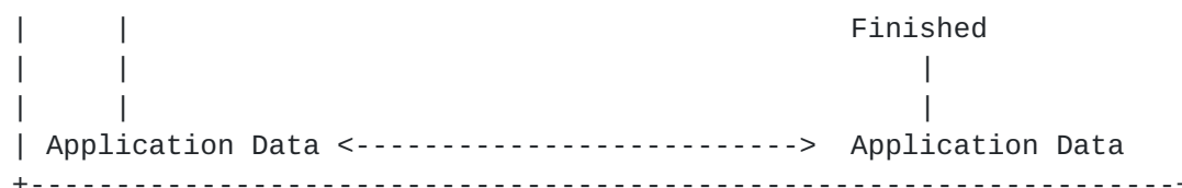
FIGURE 1: The TLS protocol. All messages followed by a star are optional. Note: This figure was taken from RFC 2246 .

The TLS security context is negotiated in the client and server hello messages. For example: TLS_RSA_WITH_RC4_MD5 means the initial authentication will be done using the RSA public key algorithm, RC4 will be used for the session key, and MACs will be based on the MD5 algorithm. Thus, to facilitate the Kerberos authentication option, we must start by defining Kerberos cipher suites including (but not limited to):