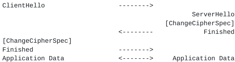
Fig. 2 - Message flow for an abbreviated handshake

The contents and significance of each message will be presented in detail in the following sections.