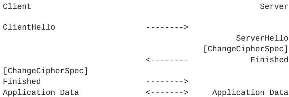
Fig. 2 - Message flow for an abbreviated handshake

The contents and significance of each message will be presented in detail in the following sections.