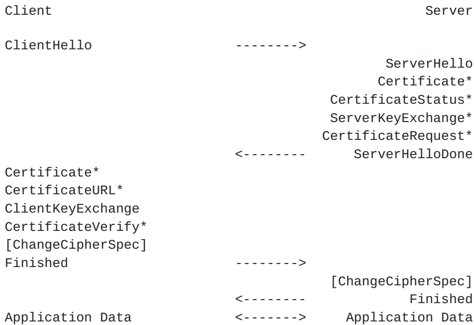
Fig. 1. Message flow for a full handshake

* Indicates optional or situation-dependent messages that are not always sent.