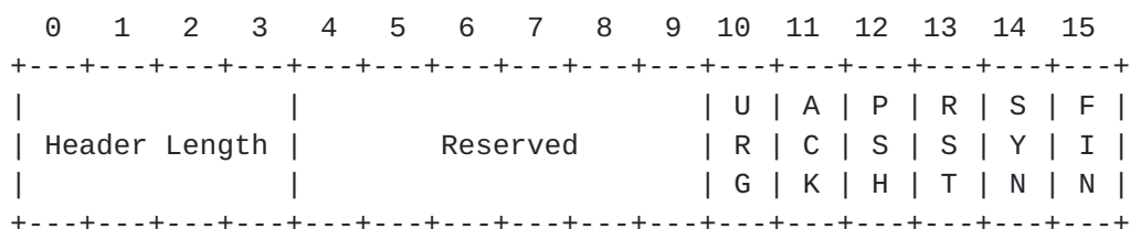
Figure 3: The old definition of bytes 13 and 14 of the TCP header.

To enable the TCP receiver to determine when to stop setting the ECN-Echo flag, we introduce a second new flag in the TCP header, the CWR flag. The CWR flag is assigned to Bit 8 in the Reserved field of the TCP header.