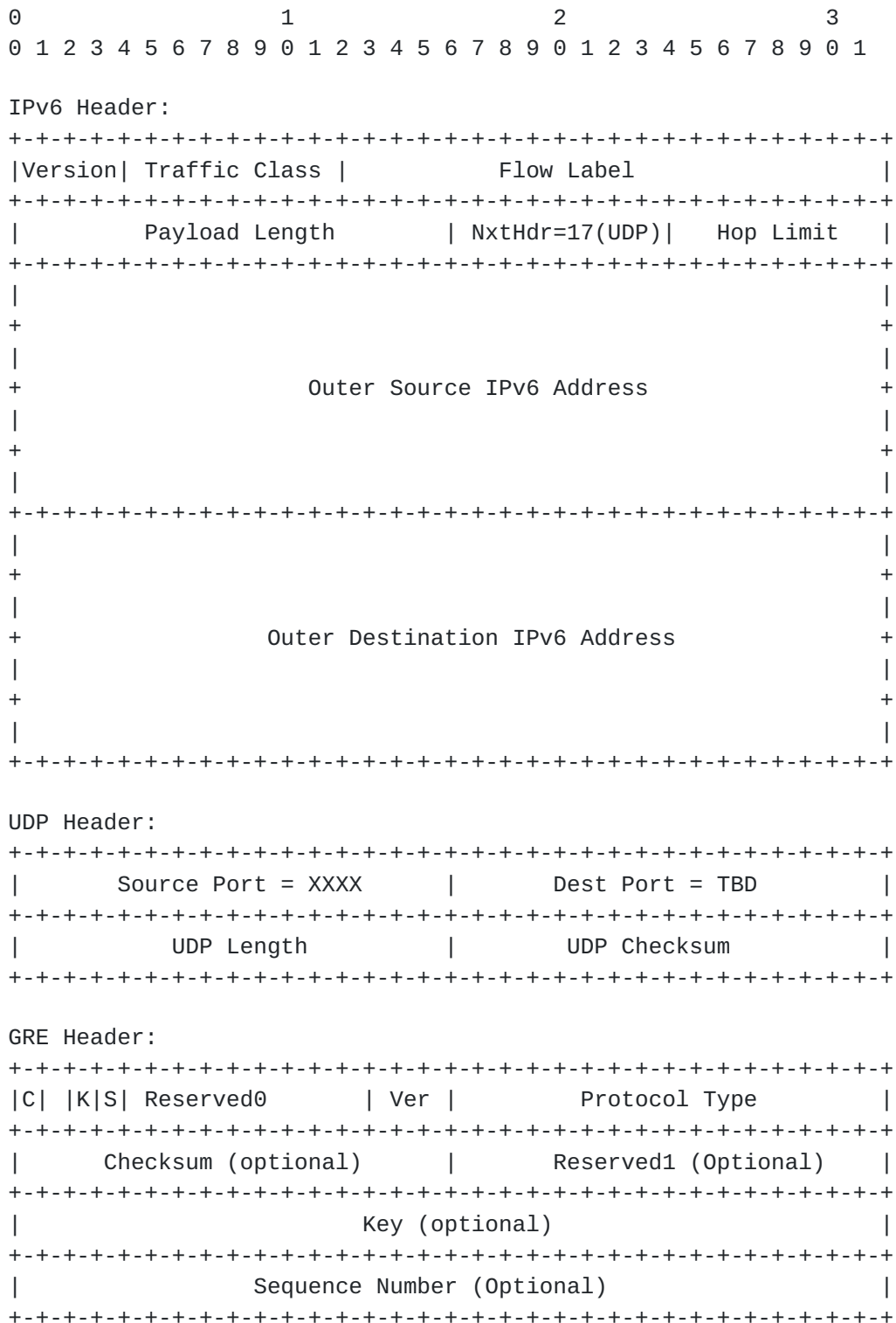
Figure 2 UDP+GRE Headers in IPv6