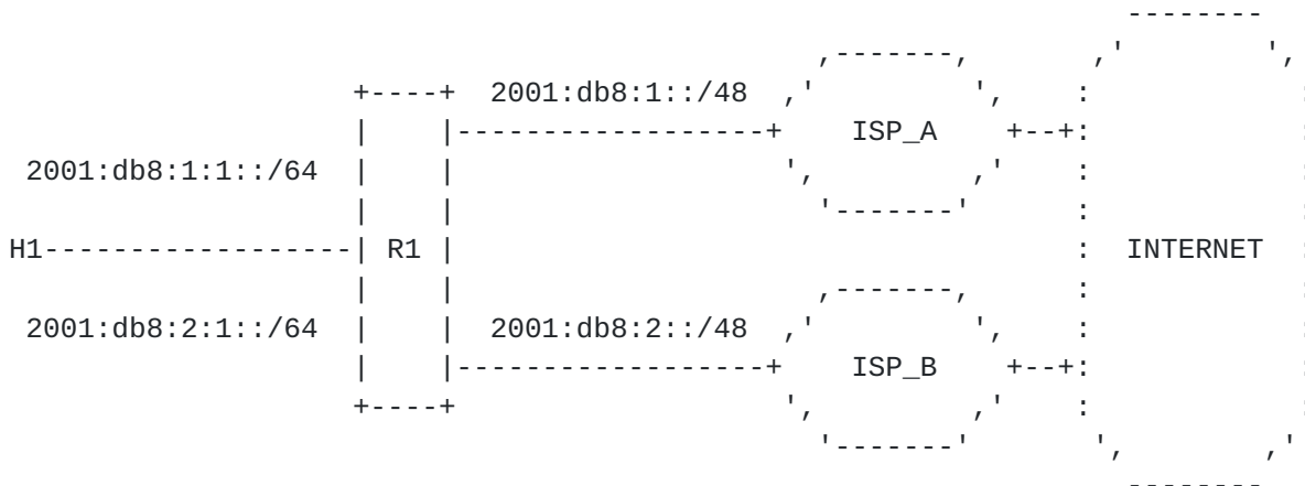
Figure 1: Single Router, Primary/Backup Uplinks

Let's look at a simple network topology where a single router acts as a border router to terminate two ISP uplinks and as a first-hop router for hosts. Each ISP assigns a /48 to the network, and the ISP_A uplink is a primary one, to be used for all Internet traffic, while the ISP_B uplink is a backup, to be used only when the primary uplink is not operational.