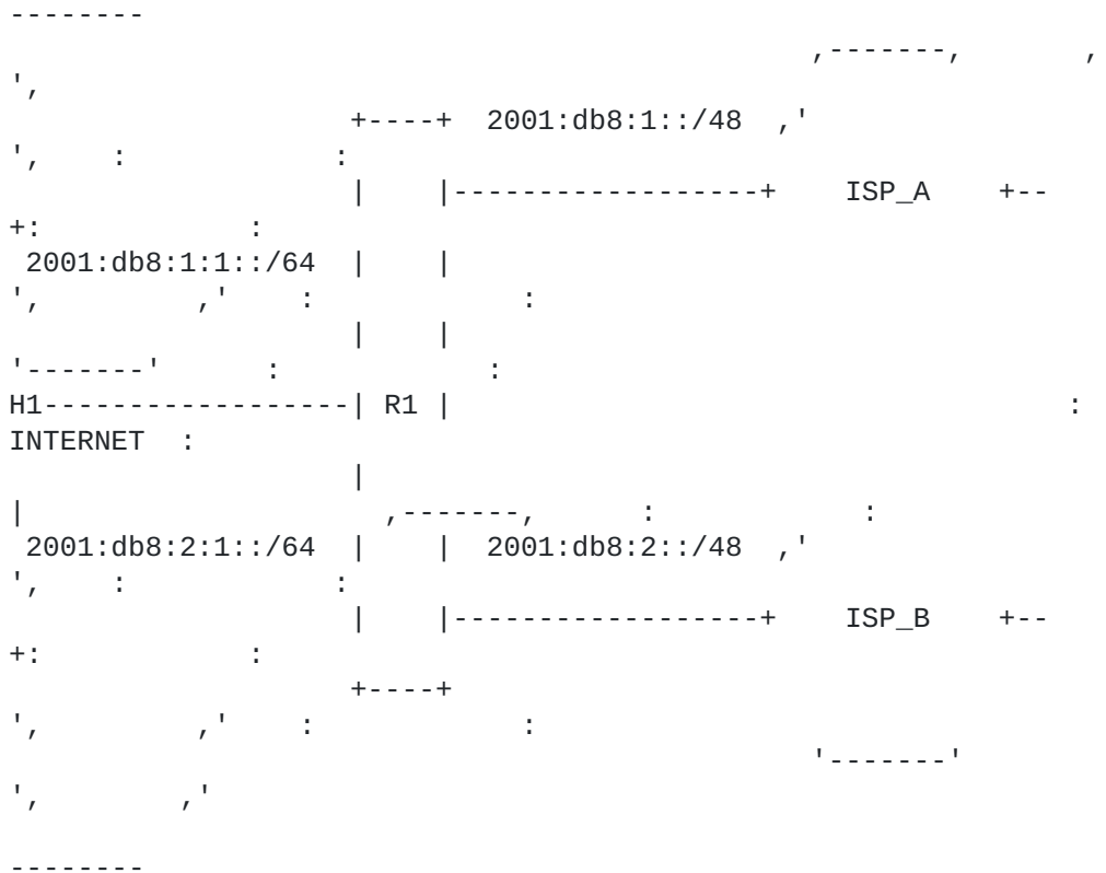
Figure 1: Single Router, Primary/Backup Uplinks

Let's look at a simple network topology where a single router acts as