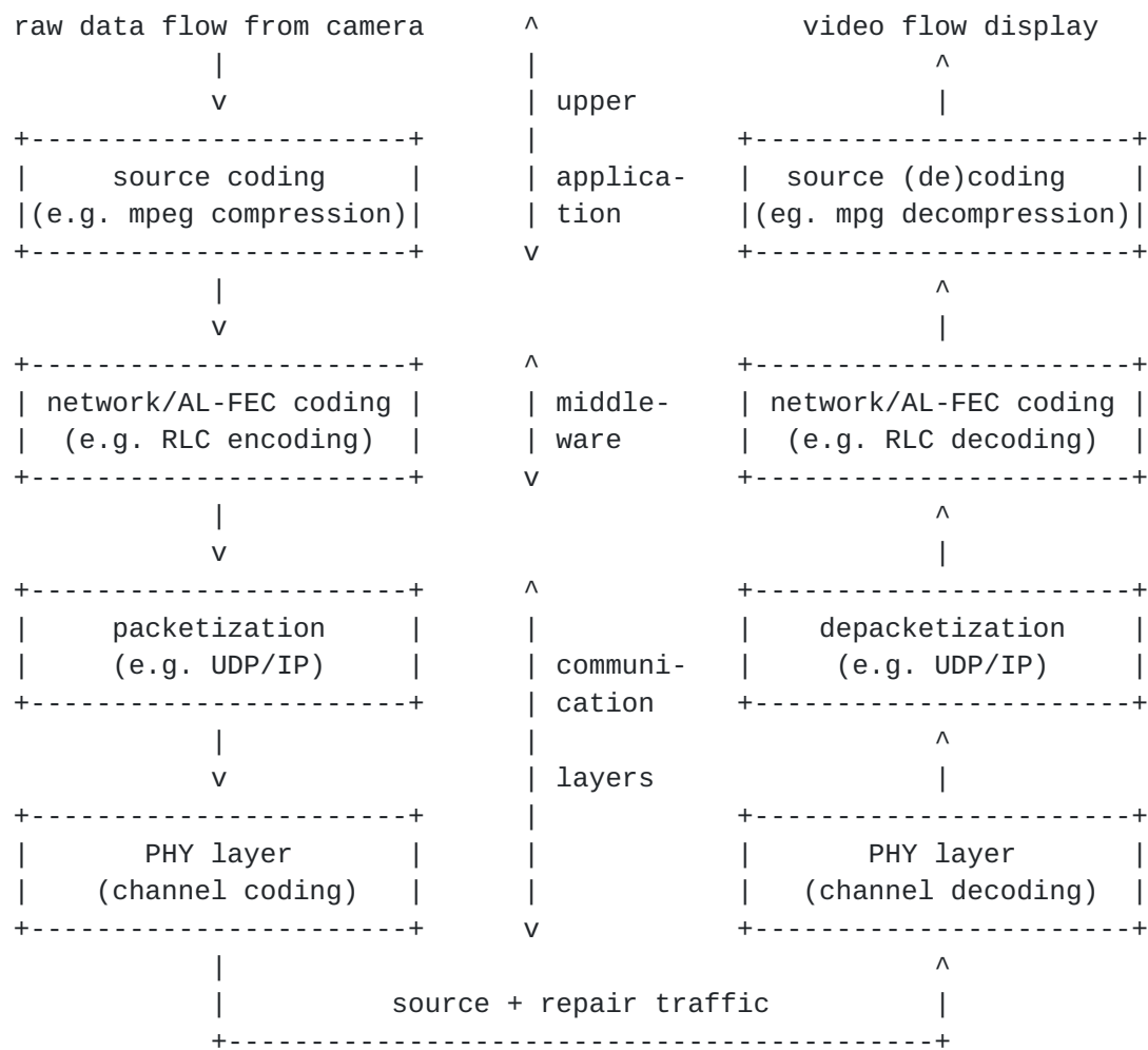
Figure 2: Example of end-to-end flow manipulation with Network Coding between the application and UDP layers (as with RMT or FECFRAME architectures). Other architectures are possible, for instance with network coding below the transport layer in order to allow re-coding within the network.

End-to-End Coding: A system where coding is performed at the source or (coding) middlebox, and decoding at the destination(s) or (decoding) middlebox. There is no re-coding operation at intermediate nodes. This is the approach followed in the FLUTE/ALC [ RFC6726 ][RFC5775], NORM [ RFC5740 ] and FECFRAME [ RFC6363 ] protocols.